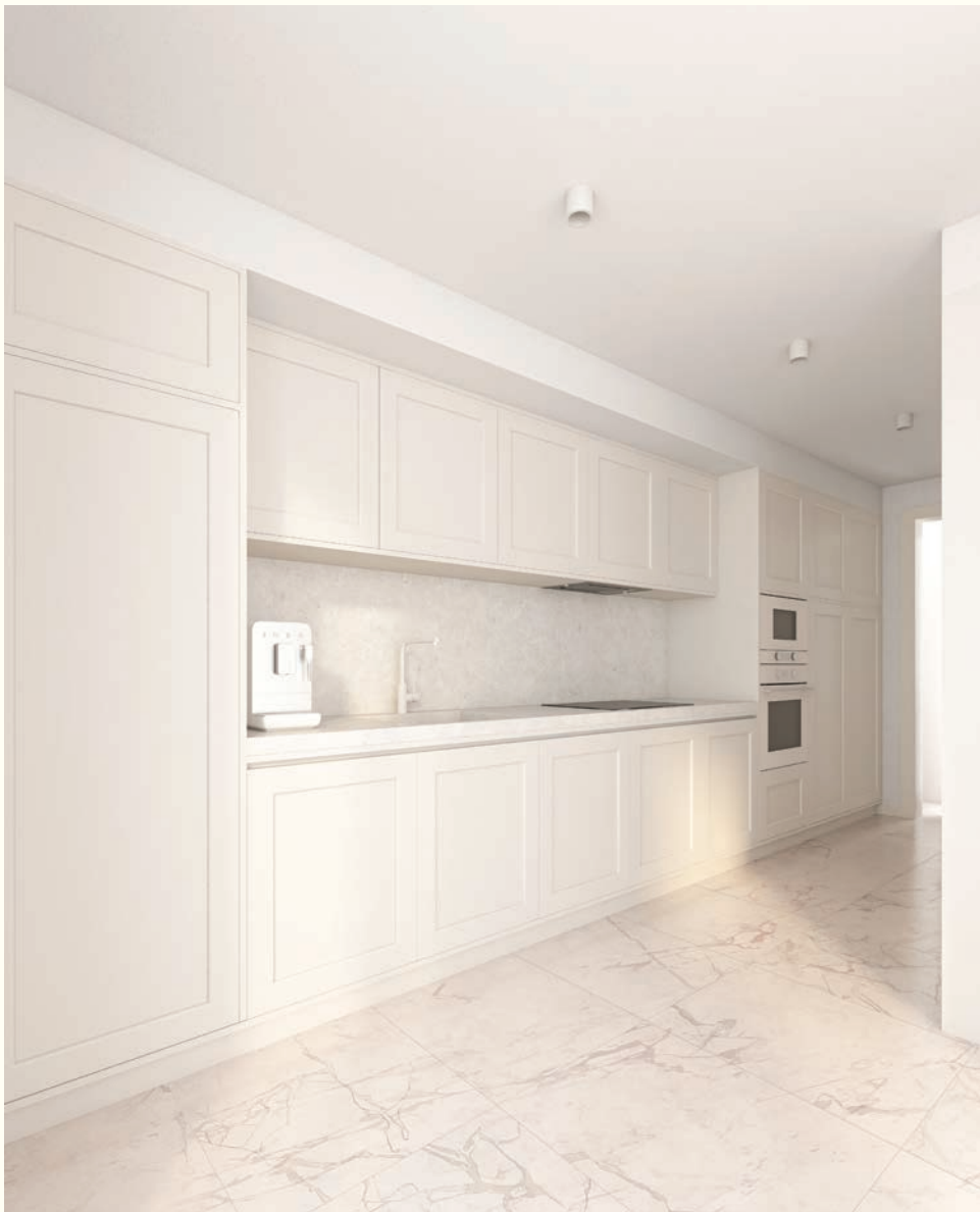
CONDE DA RIBEIRA