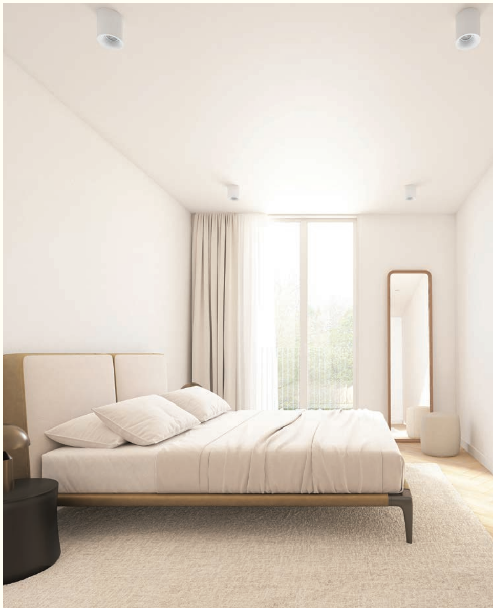
CONDE DA RIBEIRA